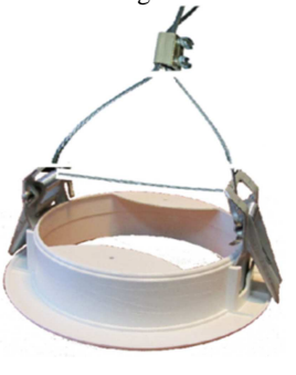
7 Fastening by a Steel Cable

2.1.2 The MK-2 can also be fastened to a flat slab by a steel cable as shown in ② .