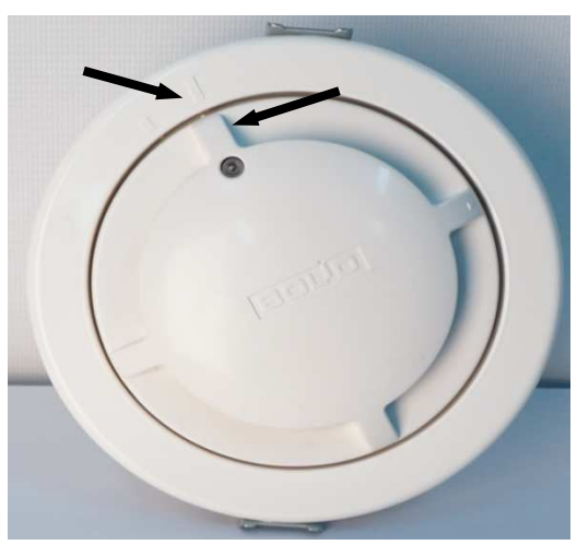
6 Twist the detector clockwise until the detector matchmark alignes with the longer match mark on the flange

2.1.2 The MK-2 can also be fastened to a flat slab by a steel cable as shown in ② .